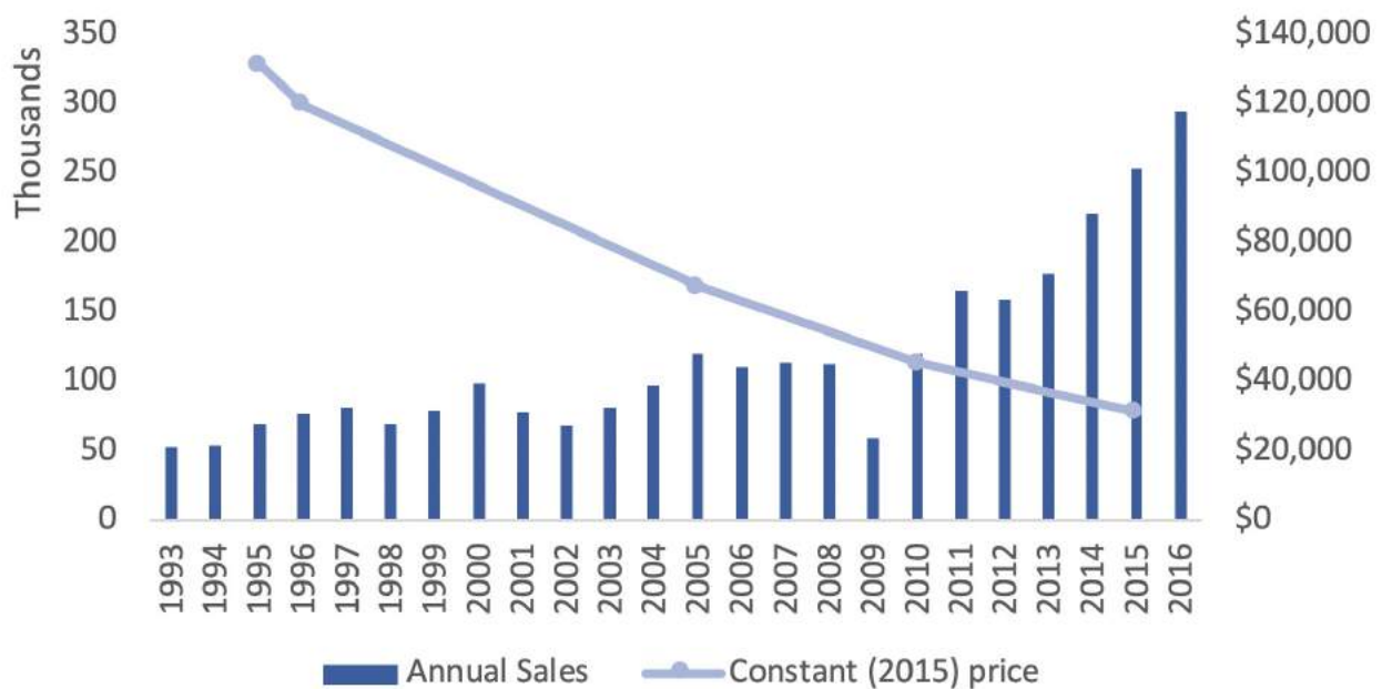
Figure 3: Sales and cost of industrial robots